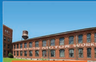
MARATHON MOTOR WORKS