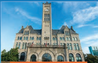
UNION STATION HOTEL